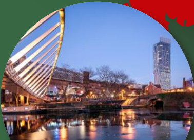
3. Birmingham 26th June 2019