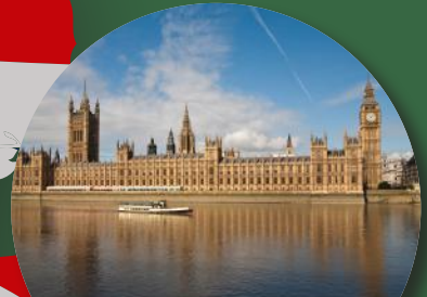
5. London 28th June 2019