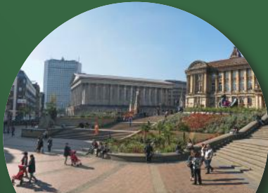
2. Manchester 25th June 2019