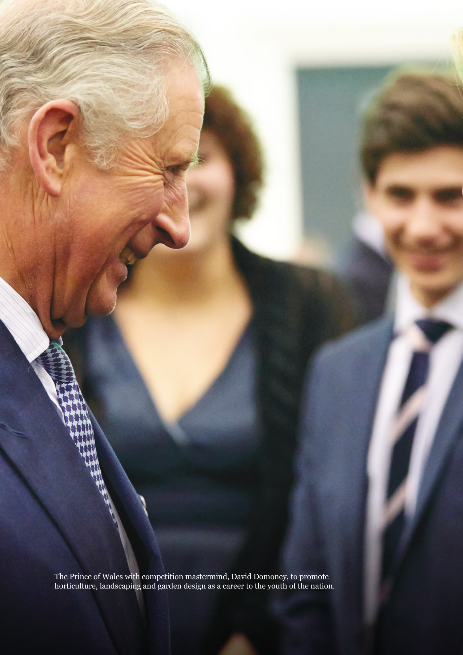
The Prince of Wales with competition mastermind, David Domoney, to promote horticulture, landscaping and garden design as a career to the youth of the nation.