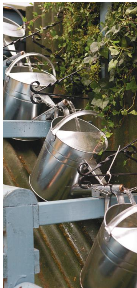
Innovative water feature designed by Will Williams (YGOTY 2015)