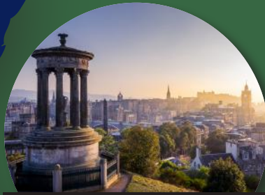
1. Edinburgh 24th June 2019