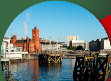
4. Cardiff 27th June 2019