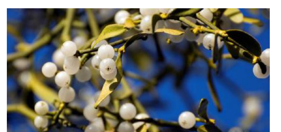
Top 3 plants for December